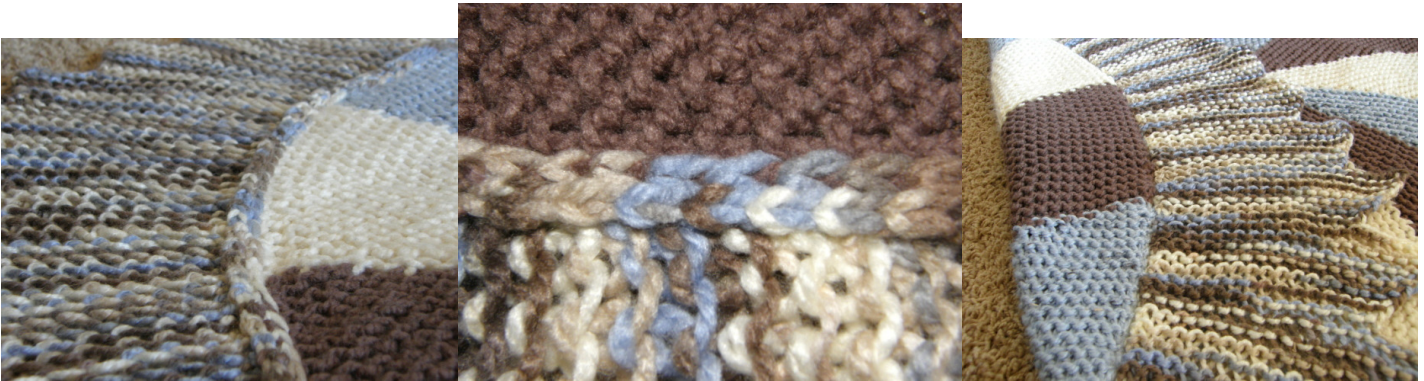
I-Cord Seam on Pinwheel Blanket

*Note: The finished result of this technique is fairly NON ELASTIC! You would therefore need to keep this in mind while deciding if this is the seaming technique you wish to employ on your given project. ☺